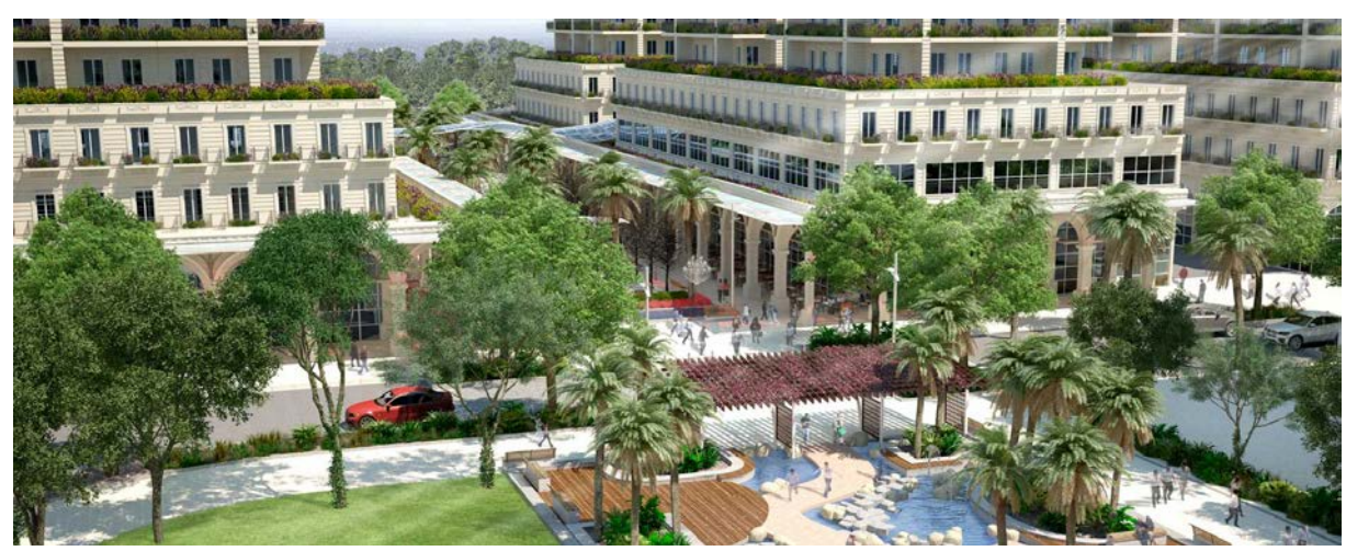
Proposed Middleton Grange Town Centre

The development provides an exciting opportunity where densities and activity will generate demand for high quality public transport services.